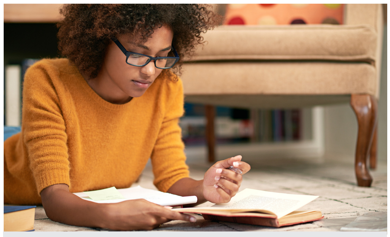
PRINCESS ROURAN ADVENTURES BOOK 1 | MEDIA KIT

Readers aged 10+ will enjoy being whisked away with Moli on a magical page-turning adventure as she discovers her connection to an ancient khanate, known as the Rouran Kingdom, and unexpectedly opens the door to another realm.